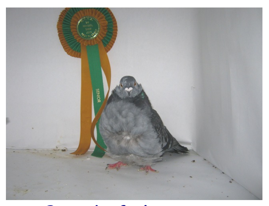
Breed of the Issue ~ The Chinese Owl ~

Official mouthpiece of the National Fancy Pigeon Association Volume 2. Issue 4.