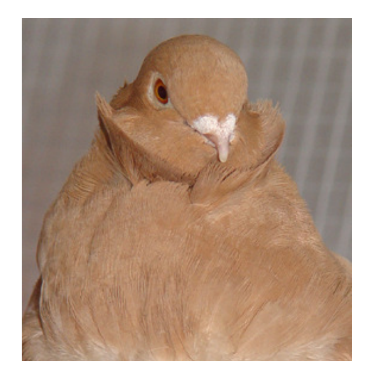
General: The Chinese Owl has been called one of the most challenging breeds of pigeons, but it is also one of the most rewarding.