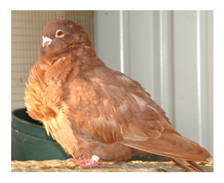
Colors: The standard currently recognizes 33 different color classes with breeders continuing to develop new colors and patterns.

Description: The present Chinese Owl Standard requires a small, short, stocky bird with a wide bold head and neck. It has a clear alert eye with a fine refined eye cere. The beak is small and dainty. This breed has an upright station with the eye being located over the ball of the foot. The standard calls for a wide, high flaring "collar" with a distinct gap on the back of the head; a profuse upper and lower breast frill (split with a horizontal part) that covers the wing butts, and large distinct "pantaloons". Each of these three features is valued equally. The legs of the Chinese Owl are short but graceful, and must be free of feathers below the hock. Chinese Owls with forked or split tails, feathering below the hock, red eye ceres, African Owl type heads, excessive plucking or trimming, or out of condition birds will be disqualified in the showroom and therefore should be avoided.